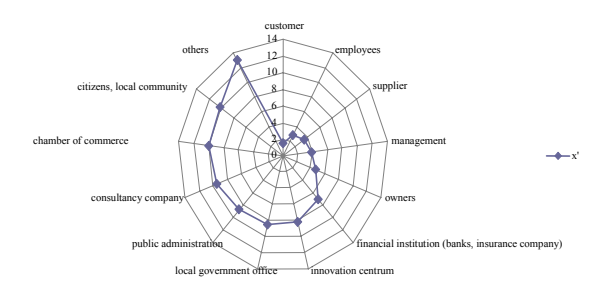
Fig. 2: Identification of stakeholder groups (sector: processing industry)

The results are shown in the diagram in Fig. 2. Customers rank first, followed by employees, suppliers, management, owners, financial institutions, centres of innovation, local and state government authorities, consulting companies, chambers of commerce, with the local community being in the last position.