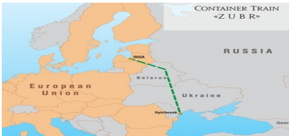
Fig. 3. Latvia - a bridge between Europe and Asia [6]

with the opportunity to further deliver the goods to Turkey and other Black Sea ports and return them to the Baltic States and Scandinavia (see Fig. 3).