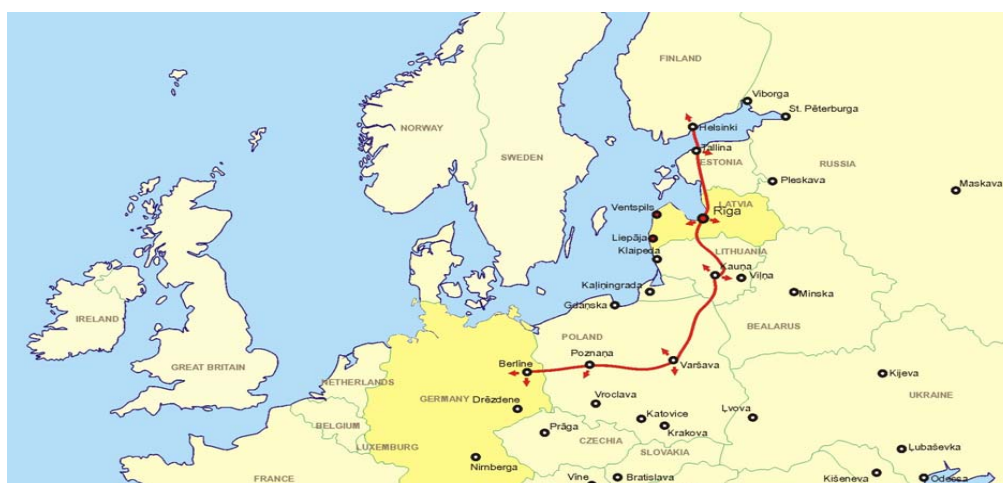
Fig. 4. Perspective railway line Rail Baltica [6]

operations, cargo storing, dealing with custom formalities etc. Latvian international road cargo transporters mostly work for transit. No doubt that stable transit cargo amount increase, cargo value added tax increase, development of product distribution and logistic centers is the main priority in Latvian national economy. The biggest investments in transport infrastructure are given to harbours, roads and railroad in the directions which serve for transit cargo flow. The Trans-European railway Rail Baltica, linking Helsinki – Tallinn – Riga – Kaunas – Warsaw and continuing on to Berlin, is to be developed within the territories of the cooperating EU Member States (see Figure 4).