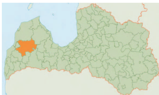
Figure 1 – Kuldiga region at the map of Latvia ( http://www.kuldigasilt.lv )

The Kuldiga region is a municipality of the Kurzeme District in the western part of Latvia. The region was formed in 2009 according to administrative territorial criteria merging 13 parishes (see Figure 1 ).