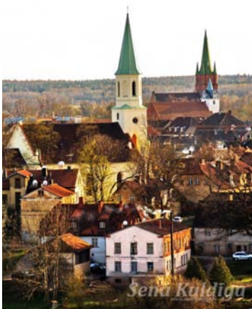
Figure 4 – The view of Kuldiga town

This case study is based on research of public utilities and public services, provided after the Kuldiga region had been created during administrative territorial reform in Latvia in 2009. The case study includes Kuldiga Heat and Kuldiga Water.