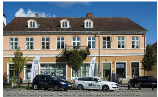
Figure 3 – Kuldīga town centre – a library building

A study carried out by the authors covering three regions in the Kurzeme district: Kuldīga (see Figure 3 and 4 ), Aizpute and Ventspils, revealed common problems (Zabašta, 2010). Each parish independently performed public water and DH services, maintained accounting and obtained payments from customers. Therefore, the regional administrations did not have correct information concerning the overall situation on its territory. Since each parish maintained its own customer billing and property accounting system, the regional administration was not able to provide a common policy related to clients and debtors, due to a lack of timely information. A significant part of the regional property was not equipped with water and heat meters at the entrance to the building, thus water consumption in many cases was determined by local consumption standards, for example, per person and sometimes by the number of animals owned by property owner. Different water tariffs were applied, which were not determined based on actual costs. Because of privatisation formerly public DH, water supply and sewerage infrastructure, in many parishes it ended up in private hands and the new owners charged.